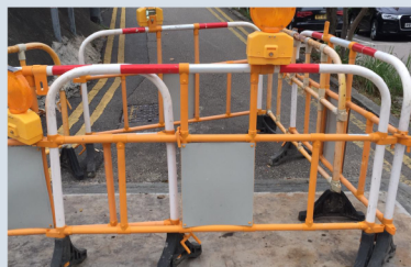
左：阻塞工程車進入的石柱已移除 Left: Two road blocks removed at the entrance of Tin Kwong Road

另外，本會也一如以往於1月開辦了記分員課程及2月開辦裁判課程。記分員課程由記分員長任偉恩主教，參加人數17名。裁判課程則由裁判長盧詠欣主教，參加人數15名。定必為本地聯賽提供更多有質素之工作人員。